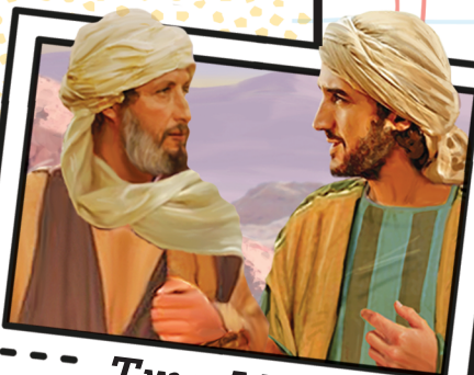
Two Men --