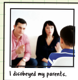
I disobeyed my parents.