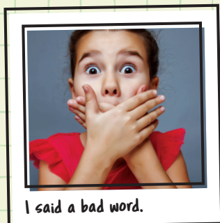
I said a bad word.