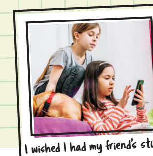
I wished I had my friend's stuff.