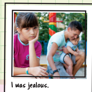
I was jealous.