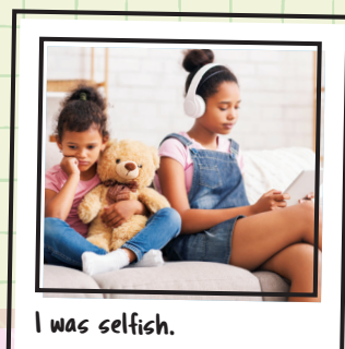
I was selfish.