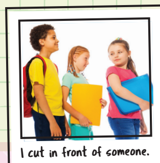
I cut in front of someone.