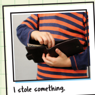
I stole something.